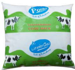
Plastic sheet used for packing of milk