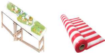
Plastic Sheets used for spreading on dining table