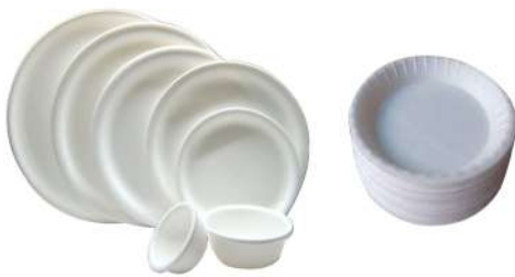
Polythene / Plastic / Styrofoam (Thermocol) Plates