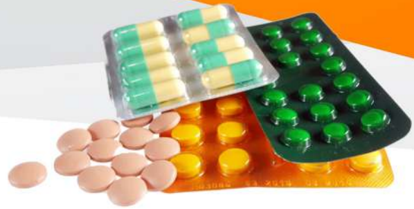
Plastic sheet used for packing medicine