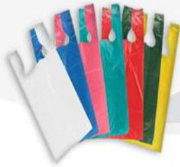
Polythene / Plastic / Polypropylene carry bags