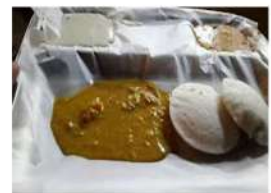
Plastic sheet pouches used for cooked food wrapping