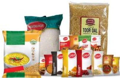
Multilayer Packaging Materials and Plastic sheet used for packing of pulses, cereals