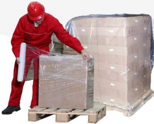
Plastic sheet used for Industrial Packing