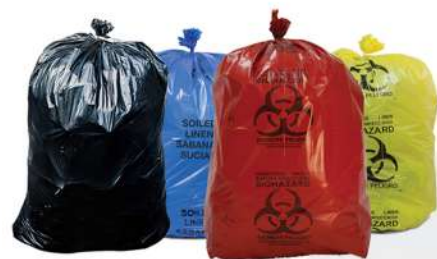
Plastic bag of more than 40 x 50 cm in size used for collection and disposal of solid and biomedical waste