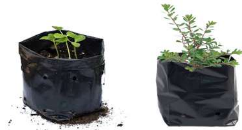
Plastic bags and sheets used in horticulture nurseries