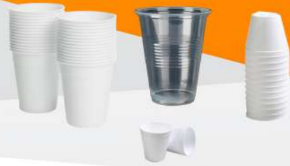
Polythene / Plastic / Styrofoam (Thermocol) Cups