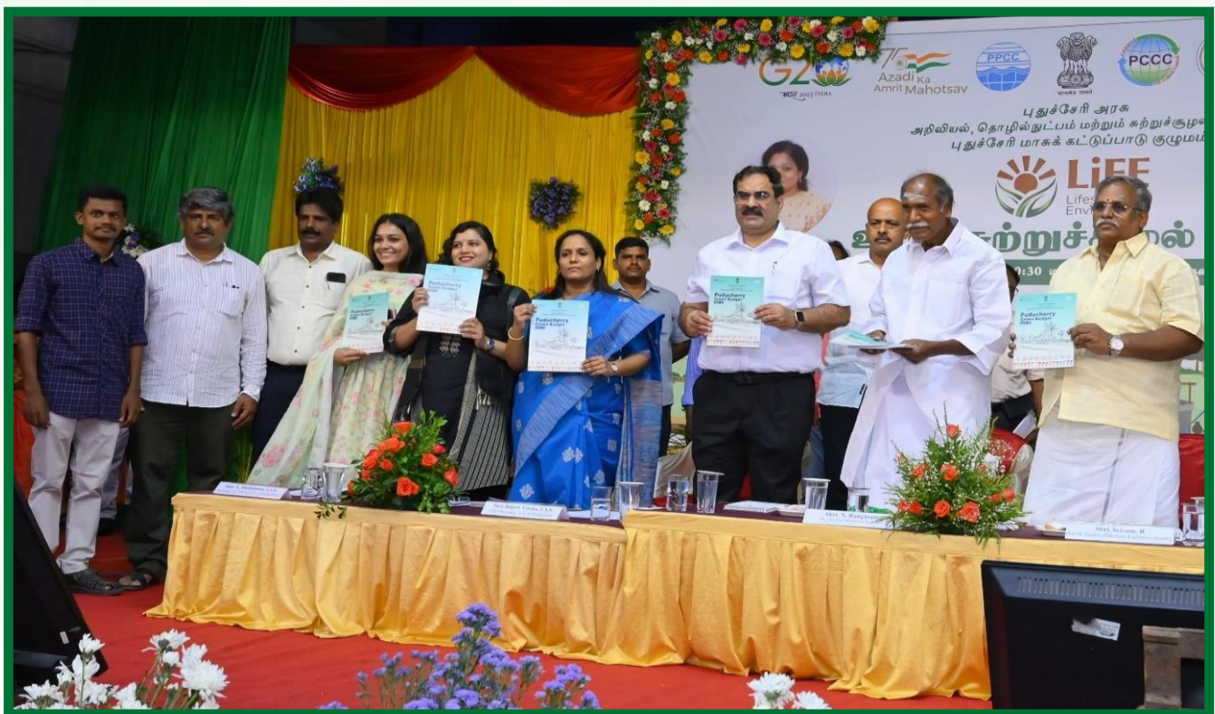
The Hon'ble Chief Minister of Puducherry releasing the Green Budget Report 2023 - 24.

In terms of SDG mapping, out of the 15 departments, 12 contributed to SDG 13, making climate action a major focus of green/environmental sustainability activities. SDG 6 (clean water and sanitation), SDG 7 (affordable and clean energy), and SDG 12 (responsible consumption and production) were included in the activities of eight departments. SDG 3 (good health and well-being) and SDG 11 (sustainable cities and communities) were included in the activities of seven departments.