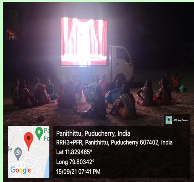
Fig. 5: LED Van Awareness Programme in Bahour Commune Villages