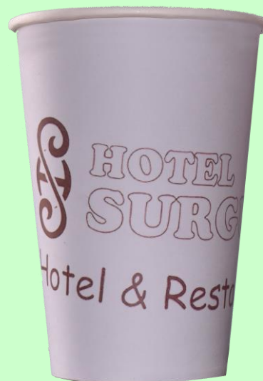
Fig 14: Restruant Owner sharing cost of the Paper cup to be sold in Stall