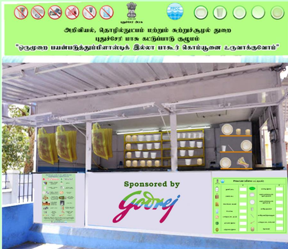
Fig 12: Model Stall