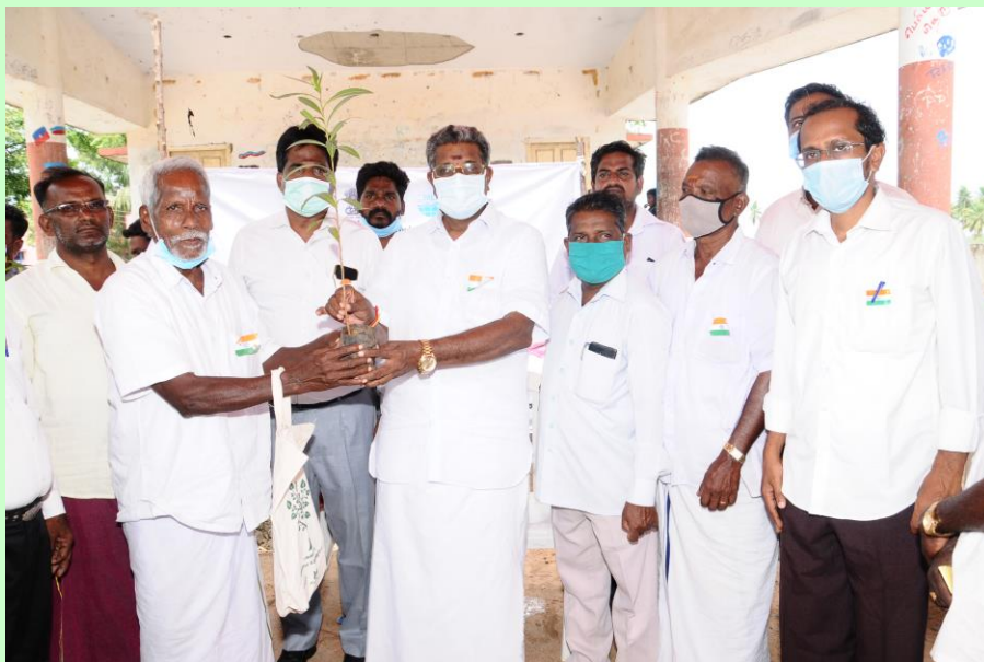
Fig. 6: Hon'ble Deputy Speaker Thiru. P. Rajavelu has inaugurated distribution of alternate products in the Manamedu Village