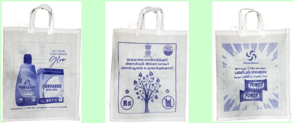
Fig 13: Brand Owner sharing cost of the Bag to be sold in Stall

Cost of the alternative products are generally higher than SUP. In order to reduce cost of the alternate products, advertisement of brand owner products are printed on the non-woven /cloth bags, paper cups, etc. Brand owner bear part of the cost of the bags/cups towards advertising their products. Actual cost of bag is Rs. 5.50/- but it will be sold @ Rs. 3.50/- in the stall.