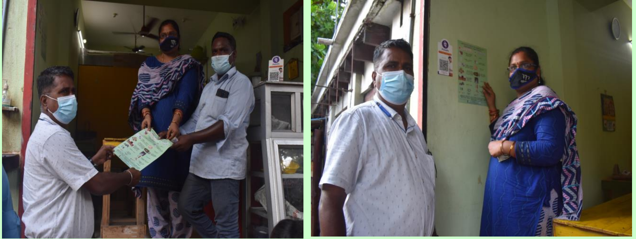
Fig. 10: The Commissioner, BCP distributing Stickers to the shops