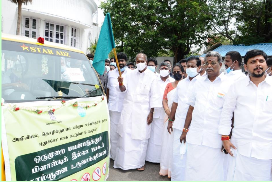
Fig. 4: Hon'ble Chief Minister has inaugurated LED Van Awareness Programme

Hon'ble Chief Minister has inaugurated LED Van Awareness Programme about "Ill effect of SUP" on 15 th August, 2021 for Bahour Commune for creating awareness.