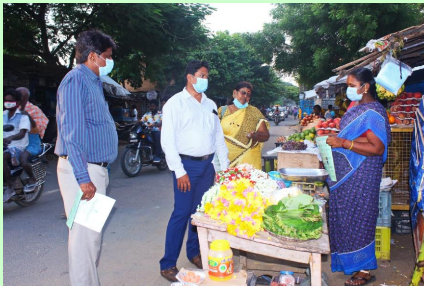
Fig 15: Inspection team insisting not to use SUP in flower shop

Inspection in Shops and Commercial Establishments was carried out in Bahour Commune on 23.09.2021 by the team consists of Revenue, BCP, SHO and PPCC. They insisted all the shops and commercial establishments not to use single use plastics.