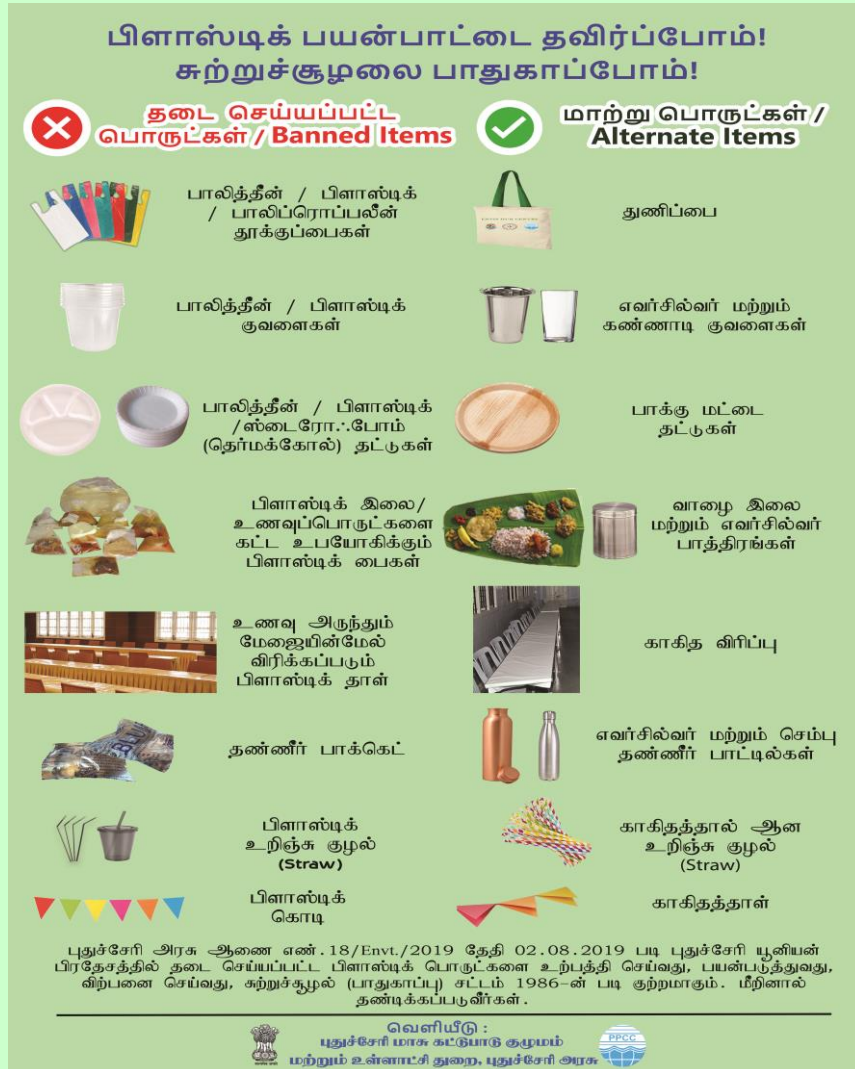
Fig. 9: Sticker Sheet distributed in all shops of Bahour Commune

To avoid the usage of SUP in shops and other Commercial centers in the Bahour Commune, sticker sheet on banned items and its alternatives were distributed and pasted in all the shops in co-ordination with the Commissioner, BCP, Puducherry.