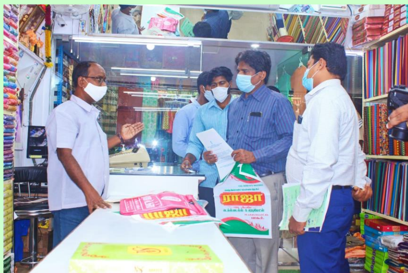
Fig 16: Inspection team insisting not to use SUP in textile shop