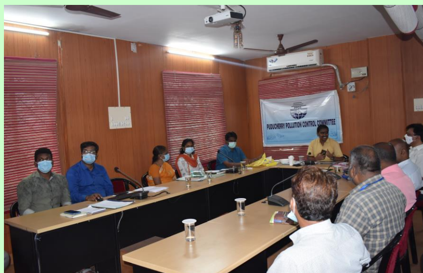
Fig 3: Interaction Meeting under the Chairmanship of Director with Brand Owners

Interaction meeting with Brand Owners was held under the Chairmanship of Director on 19.08.2021 for elimination of usage of plastic cups and water pouches in Arrack shops and Bars.