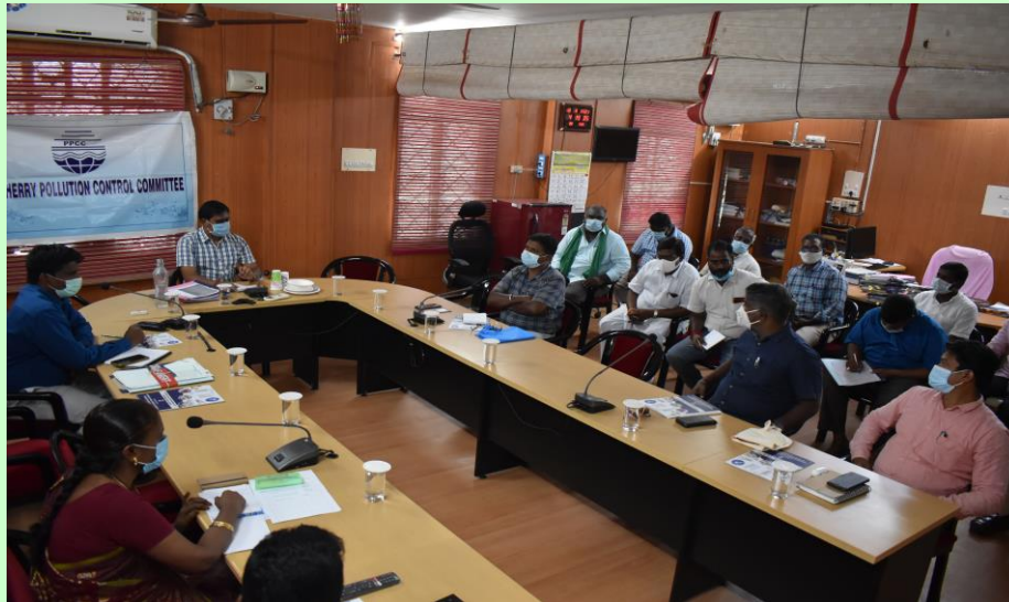
Fig. 2: Interaction Meeting under the Chairmanship of Director with Bar Association

on 10.08.2021 for elimination of usage of plastic cups and water pouches in Arrack shops and Bars.