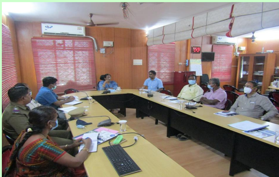
Fig. 1: Interaction Meeting under the Chairmanship of Secretary(S,T & E) with Line Department

Interaction meeting with line Department viz. Revenue, Commune Panchayat and Police was held under the Chairmanship of Secretary (Science, Technology and Environment) on 16.07.2021 and discussed about various measures to be taken to declare Bahour Commune as SUP free Commune.