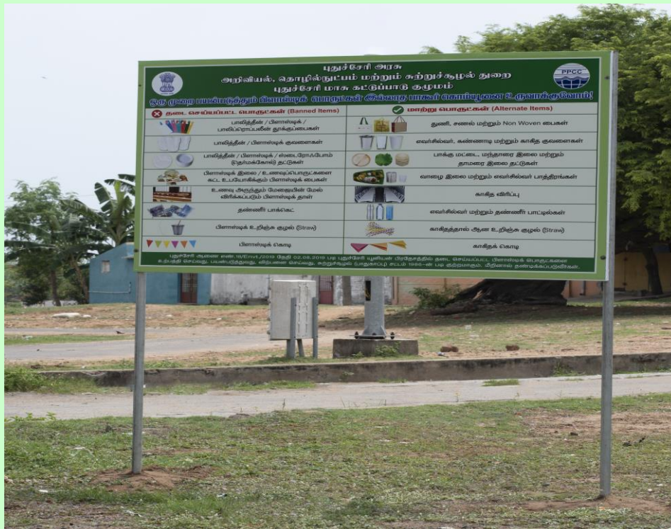
Fig 11: Banner installed in Villages of Bahour Commune

Banner of banned SUP items and its alternatives was erected in all the 35 villages and public gathering places of Bahour commune. It is providing access to the public to aware about banned Single use plastic items and corresponding alternate items.